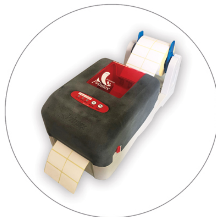
OPTIONAL: External roll holder suitable for big rolls